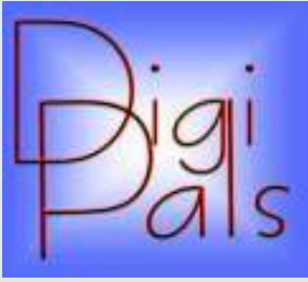
DigiPals visit to the Newcastle Botanic Gardens.