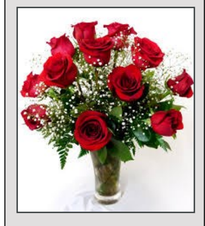
To those who are ill we send our best wishes for a speedy recovery.

For all our members who are celebrating birthdays and anniversaries - hearty congratulations !