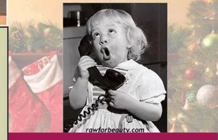
Growing old is hard work... The mind says "yes" but, the body says "what the hell are you thinking"

If a telemarketer calls, give the telephone to your 3 year-old and tell her it's Santa.