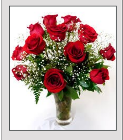
To those who are ill we send our best wishes for a speedy recovery.

For all our members who are celebrating birthdays and anniversaries - hearty congratulations !