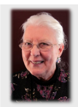
Computer Pals Mission

{\it Email: cpals new cast le@computer pals.gmail.com}