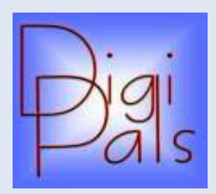
DigiPals visit to the Newcastle Botanic Gardens.