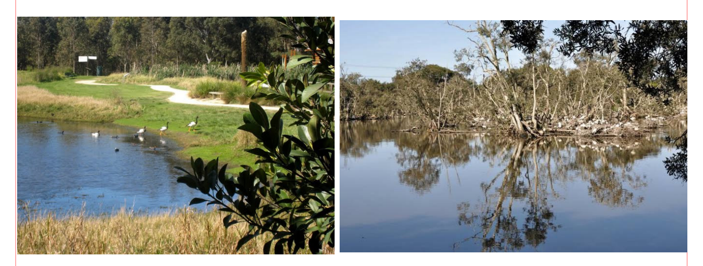
A few examples of the great photos taken by Digipals members on the day

Our next meeting is a combined day out with the ComputerPals group at Fort Scratchley on October 10. Bring your picnic lunch, don't forget your camera and don't be late. Graham