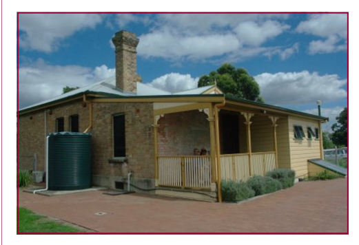
The School Master's Cottage Built in 1890

It will be interesting to see the photos (post them to our Digipals site please) and there will be some surprises, you can bet on that. Happy snapping and we'll see you on the 13<sup>th</sup> March. Graham Woolridge