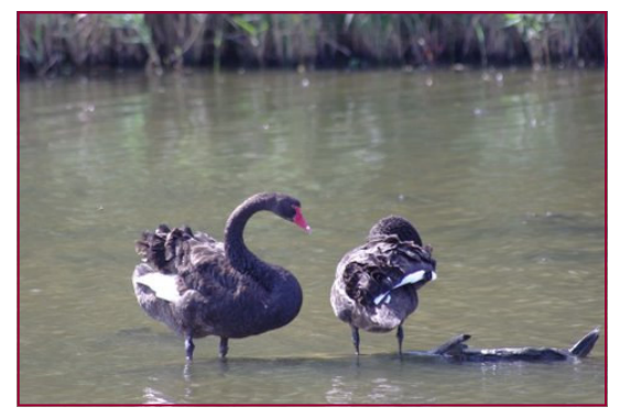
Some of the bird life captured by Digipals members