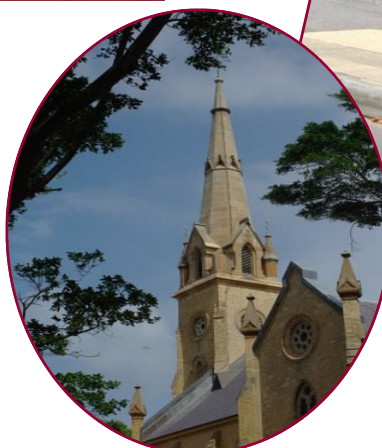
Some of the photos taken at Civic Park