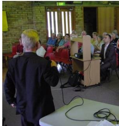
The workshop begins!