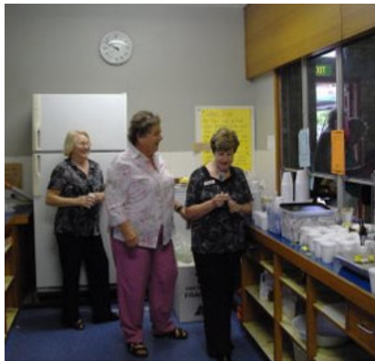
It’s hard to get good help these days!!