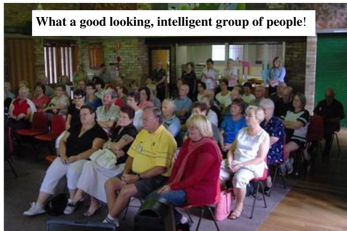
What a good looking, intelligent group of people!

We may schedule another mobile workshop at a later date - look for details in the clubroom and the Newsletter