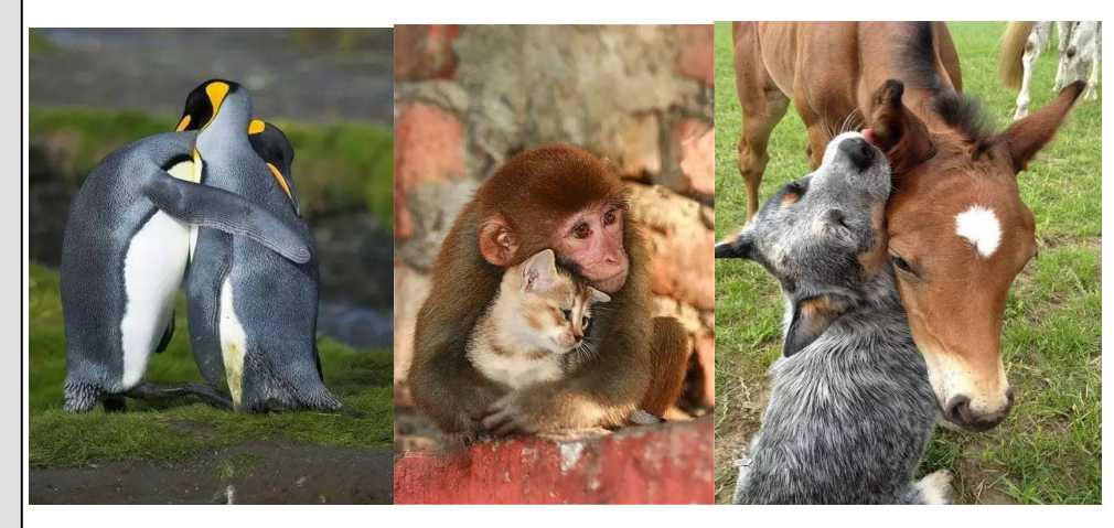
Share a hug today—One size fits all; satisfaction guaranteed.

A ghost walks into a bar. Bartender asks, "What'll you have?" Ghost says, "I'm here for the BOOs! BARINA CRAFT homebars barinacraft.com