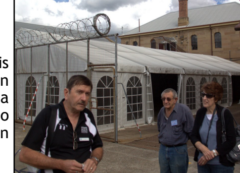
By the time this newsletter is published our next excursion will upon us. It should be a beauty - a trip to Cockatoo Island in Sydney Harbour on Saturday 2nd May.