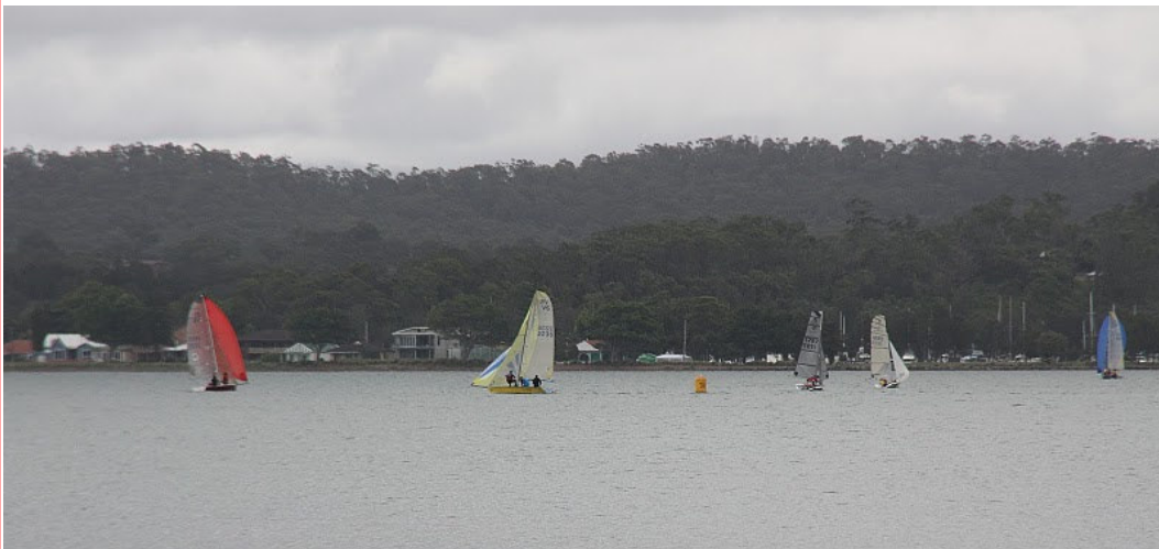
Sailing boats at Warners Bay