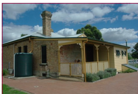
The School Master's Cottage Built in 1890

Happy snapping and we'll see you on the 13 th March. Graham Woolridge