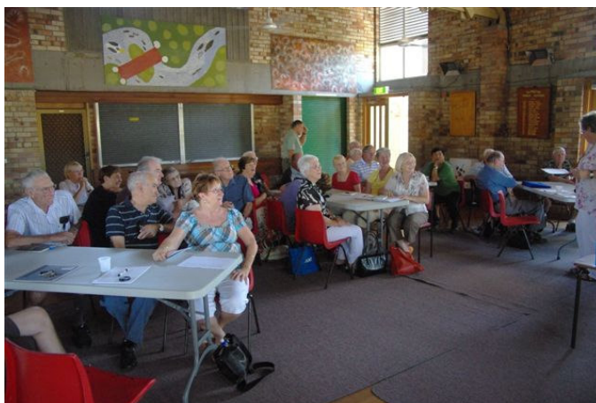
Some of the dedicated tutors at the meeting