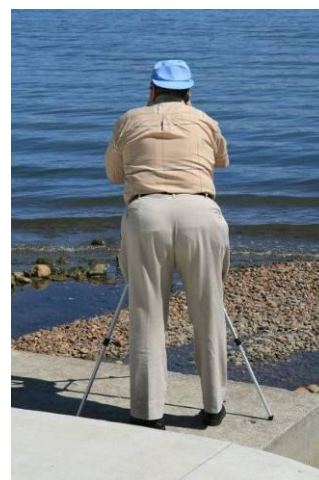
A study in concentration at Speers Point Photo shoot.