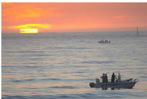
Stockton Beach - Graham Woolridge