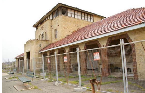
Merewether Beach Surf Club - Judy Wallace